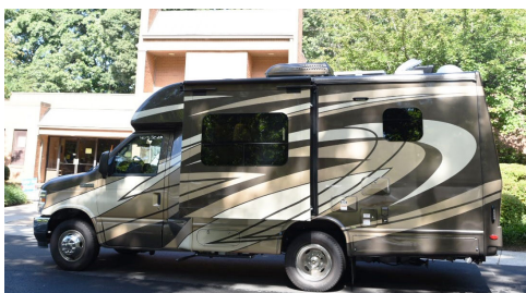
ABC Mobil Ultrasound RV

Your support will be critical in changing hearts and minds. Please consider making your most generous gift at this time to A Best Choice Mobile Ultrasound to help women in need and so that we can continue to share stories of success with you!