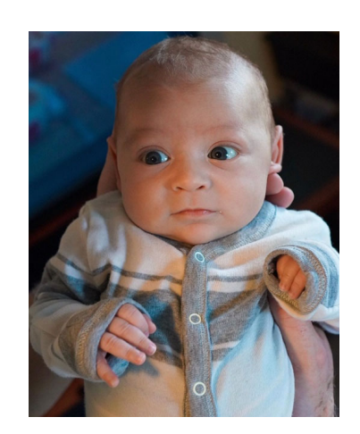
www.abestchoice.us July 2024 Newsletter Page 4